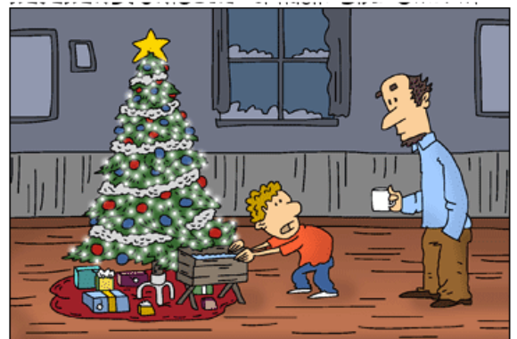
(See Luke 2:1-16) 12-19-2014 IT HAD A STAR ON TOP SO I FIGURED IT SHOULD HAVE A MANGER AT THE BOTTOM